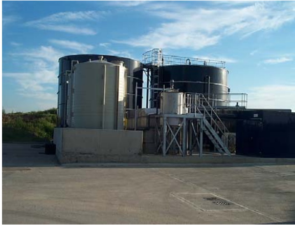
720m 3 /day Biological Treatment Discharge to sewer