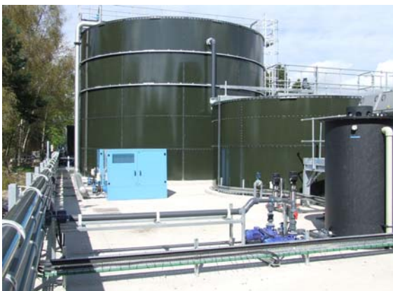
600m 3 /day Discharge to river