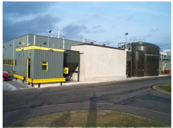
250m 3 /day Discharge to sewer