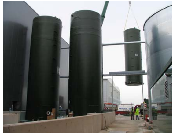
100m 3 /hour effluent balancing and pH correction