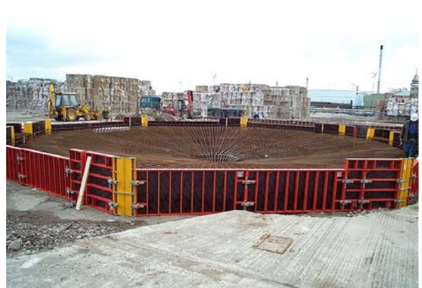
22 m diameter Clarifier