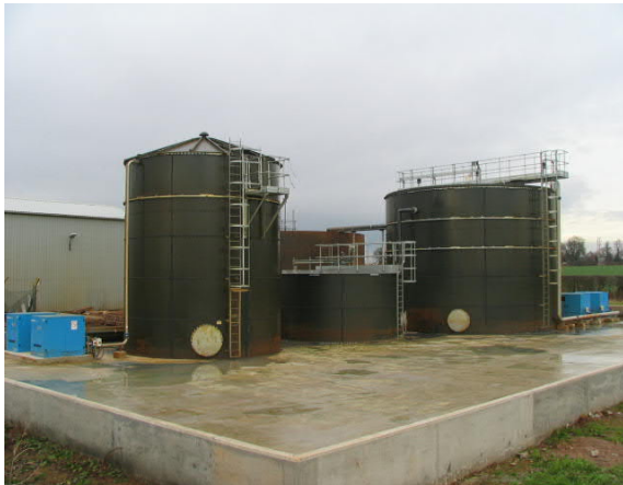
500m 3 /day Full Treatment to Sewer